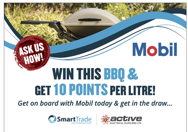
Active Electrical promotion signage.