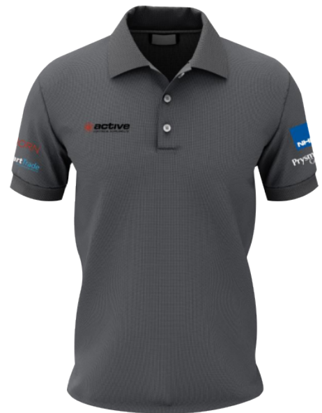
Active Electrical polos.