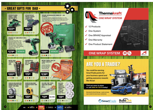
SmartTrade advert in an issue of the BuildLink catalogue.

Here are some examples of how businesses have used our logo in market.